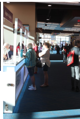
Registration for the Gathering