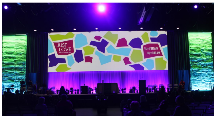
Closing worship was held on Sunday, September 24.