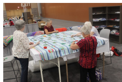
Quilting for Lutheran World Relief