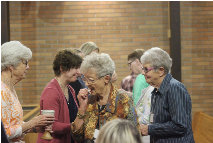
Worship with Communion began the day.