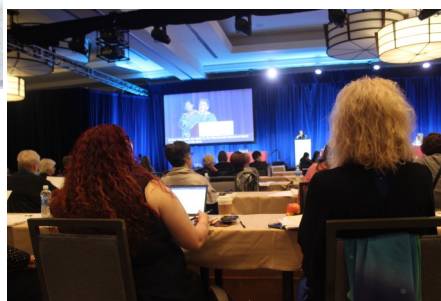
Deliberating Memorials & Budget