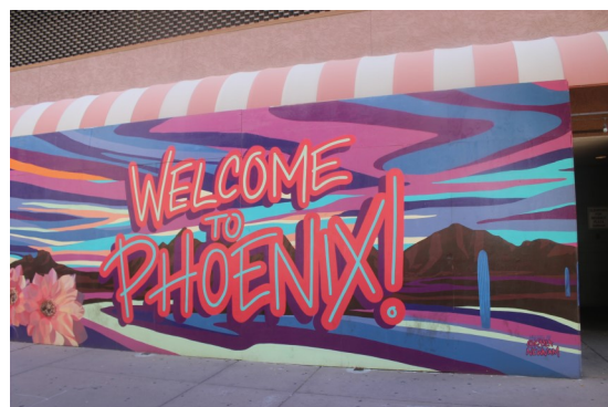
Opening reception for the Triennial Gathering featured Arizona specialties for food, music, and fellowship for about 2,000 attendees on a 96 th night on the street in front of the Convention Center. Music provided by a DJ for line-dancing!